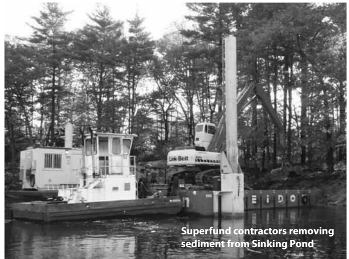
Superfund contractors removing sediment from Sinking Pond

sites, dredging occurred and wet materials were allowed to dry before being removed from the site for disposal. All of the liquid collected in the dewatering area was treated using the metals removal systems located at the landfill area groundwater treatment system. The United States Environmental Protection Agency will prepare a status update in the spring of 2012 summarizing the work completed this past year. Information on the Superfund site can be found at www.epa.gov/region1/superfund and searching for "Acton" or by contacting local stakeholders such as the Acton Water District, Acton Health Department, and Acton Citizens for Environmental Safety (ACES).